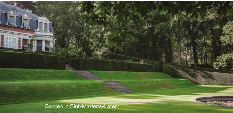
Garden in Sint-Martens-Latem.