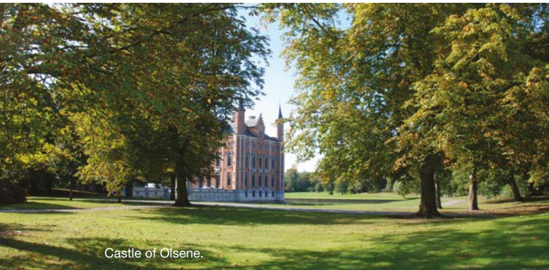
Castle of Olsene.